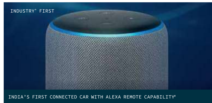
INDUSTRY* FIRST INDIA'S FIRST CONNECTED CAR WITH ALEXA REMOTE CAPABILITY*