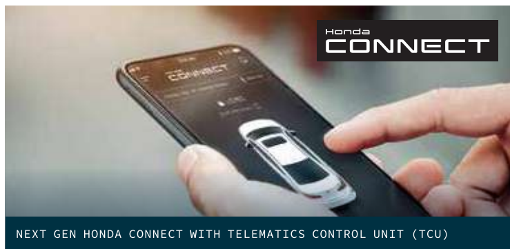
NEXT GEN HONDA CONNECT WITH TELEMATICS CONTROL UNIT (TCU)