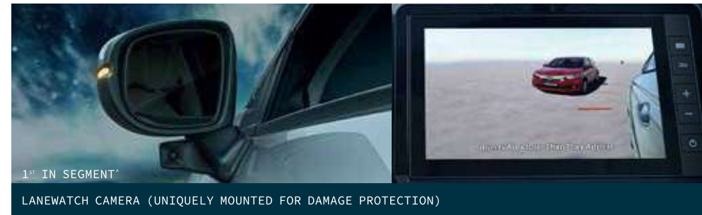
1 st IN SEGMENT* LANEWATCH CAMERA (UNIQUELY MOUNTED FOR DAMAGE PROTECTION)