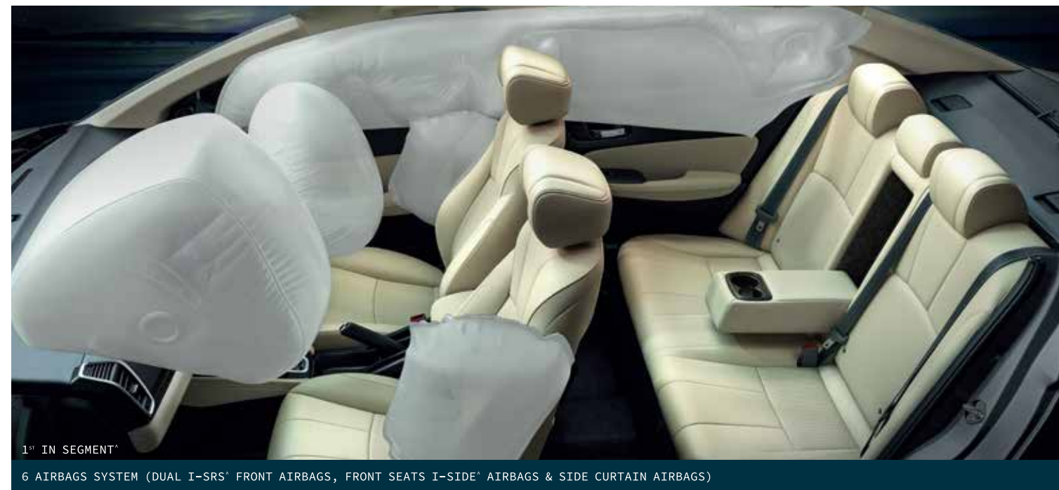
1 st IN SEGMENT* 6 AIRBAGS SYSTEM (DUAL I-SRS* FRONT AIRBAGS, FRONT SEATS I-SIDE* AIRBAGS & SIDE CURTAIN AIRBAGS)