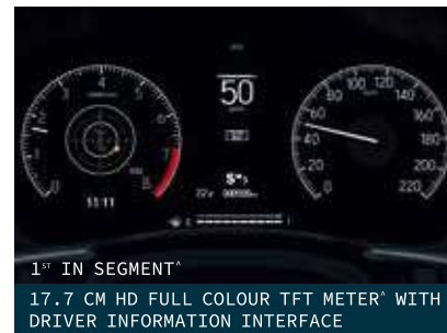
1 st IN SEGMENT* 17.7 CM HD FULL COLOUR TFT METER* WITH DRIVER INFORMATION INTERFACE