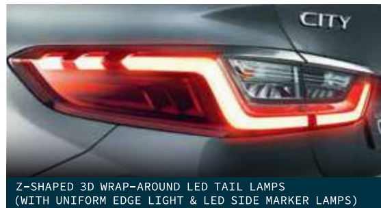
Z-SHAPED 3D WRAP-AROUND LED TAIL LAMPS (WITH UNIFORM EDGE LIGHT & LED SIDE MARKER LAMPS)