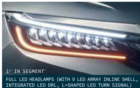
1 st IN SEGMENT* FULL LED HEADLAMPS (WITH 9 LED ARRAY INLINE SHELL, INTEGRATED LED DRL, L-SHAPED LED TURN SIGNAL)