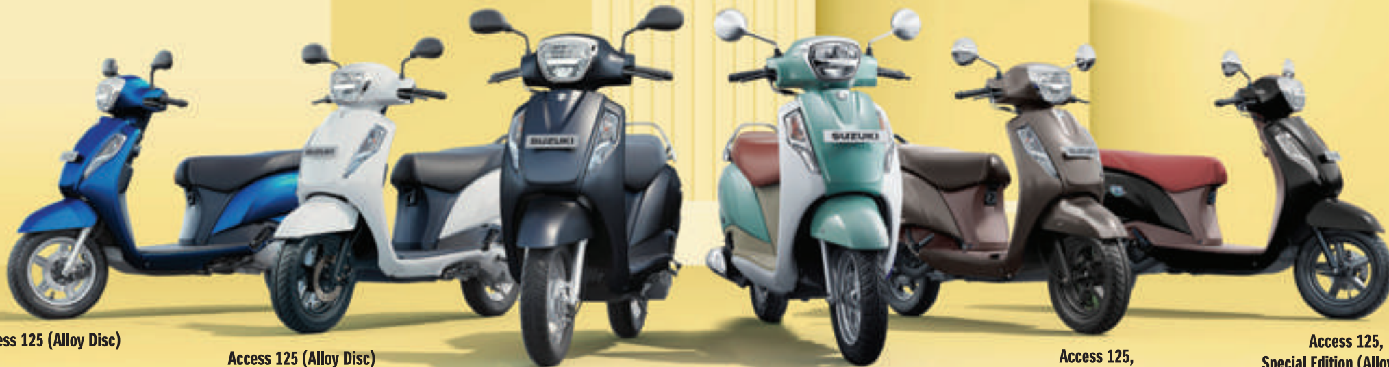
Access 125 (Alloy Disc)