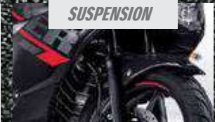
STIFFER FRONT SUSPENSION

Increased rigidity around the front section to rightly suit the separate handle set-up at front.