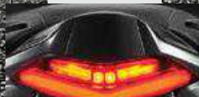
LED TAIL LAMP

Compact design with highly illuminated LED lights.