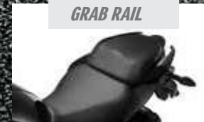
SPLIT SEAT AND GRAB RAIL

Sportier appearance to ensure foot reach by reshaping contact area of the seat with the inner thigh.