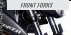
41mm LARGE DIAMETER FRONT FORKS

Increased rigidity around the front section to rightly suit the separate handle set-up at front.