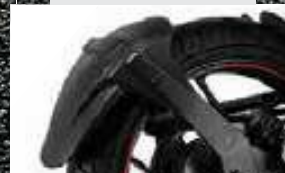
REAR TYRE HUGGER

To complement the stylish design of the premium bike.