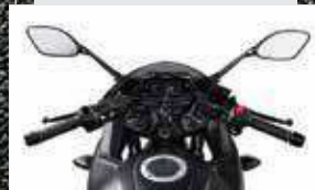
CLIP-ON HANDLE BARS

For a sporty riding position. FOR GIXXER SF