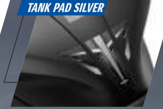
TAPE SET TANK PAD SILVER