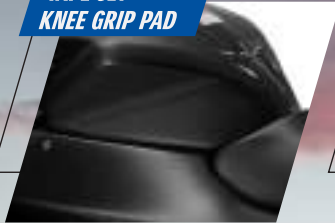
TAPE SET KNEE GRIP PAD