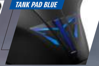
TAPE SET TANK PAD BLUE